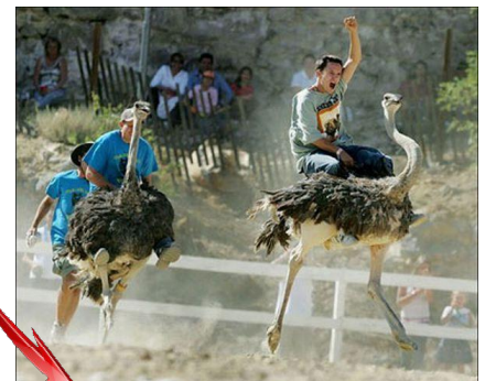
Virginia City Nevada—Ostrich Races Multi-Modal Transportation