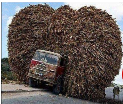
Somalia truck loaded with corn husks