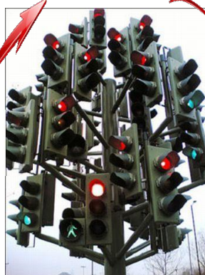
Canary Wharf, London Roundabout Signal (Statue in center of a roundabout)