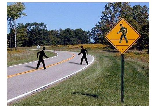
These signs are placed on the road for a reason. Please drive carefully!